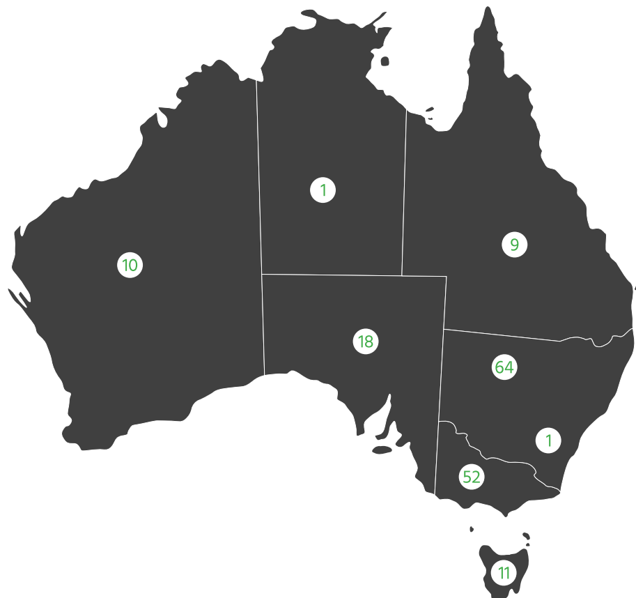
MAP OF REFUGEE WELCOME ZONES IN AUSTRALIA

There are currently 166 Refugee Welcome Zones in Australia.