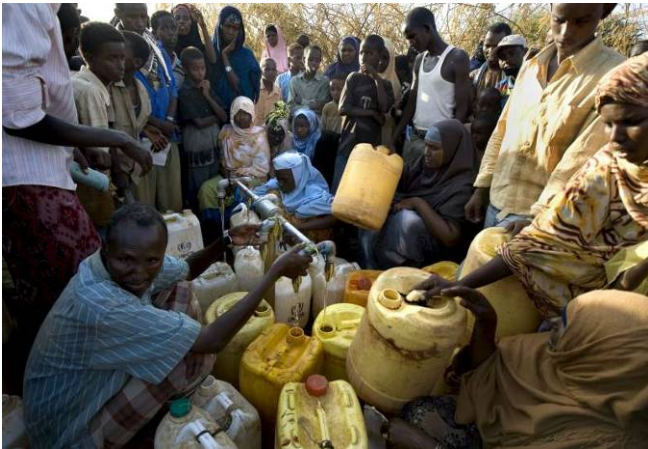
In Dadaab refugee camp in Kenya, the quantity of water is limited and pumps are unable to handle the capacity needed every day.

The majority of the world’s refugees live in countries next to their country of origin, many of them in camps. Some camps can hold hundreds of thousands of people, in conditions that are, at best, very difficult. Of the 6 million refugees in what UNHCR classifies as “protracted situations”, the average length of time spent in a refugee camp is 17 years. Food and water supplies are unpredictable and refugee inhabitants are often not allowed to leave or work outside the camp. Violence, especially rape, is common. 14