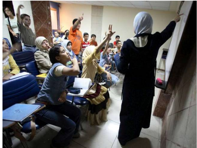
In a cramped basement in Syria's Saida Zeinab neighbourhood, Iraqi and Syrian teacher volunteers give free catch-up classes to Iraqi school children in hopes they will be able to join Syrian students at the start of the school year.

At the end of 2008, Pakistan was hosting over 1.7 million refugees, asylum seekers and potential asylum claimants. Other developing nations hosting over half a million refugees and asylum seekers include Syria, Iran, Jordan and Venezuela. These figures refer solely to people who have left their own nations and sought assistance in a second country. Germany was the only developed nation to host in excess of half a million refugees. At 582 735 in 2008, Germany’s refugee population dwarfed Australia’s total of 20 919. 11