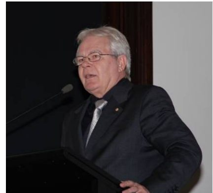
Sports broadcaster Les Murray tells of his escape from Hungary as an 11-year-old, at the NSW launch of Refugee Week 2008.