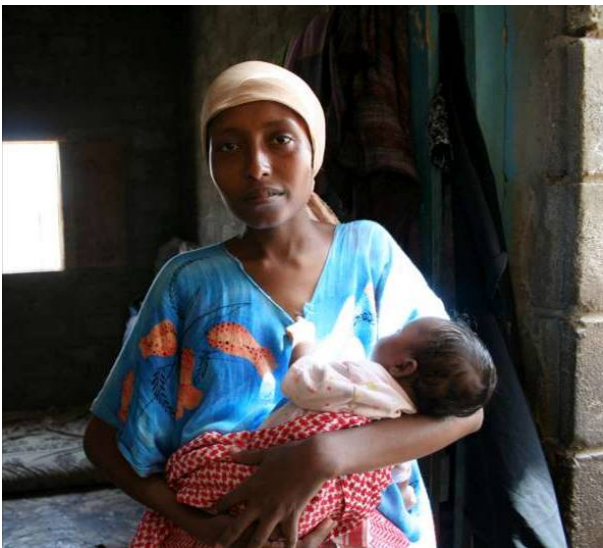
Grateful to have survived the perilous voyage across the Gulf of Aden, a mother embraces her four-month-old infant, who was born in South Yemen's Kharaz refugee camp.

In line with our obligations under the Convention, Australian law also permits unauthorised entry into Australia for the purposes of seeking asylum. Asylum seekers do not break any Australian laws simply by arriving on boats or without authorisation.