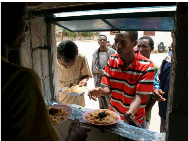
Arriving on the shores of Yemen after crossing the Gulf of Aden, a new arrival enjoys his first meal in three days.

The majority of asylum seekers who have reached Australia by boat have been found to be genuine refugees. Between 85% and 90% have typically been found to be refugees, compared to around 40% of asylum seekers who arrive via plane with a valid visa. Between July 30 2008 and June 30 2009, 217 refugee assessments on boat arrivals were carried out on Christmas Island. Of these, 206 or 95% were approved and the applicants granted protection visas. 1