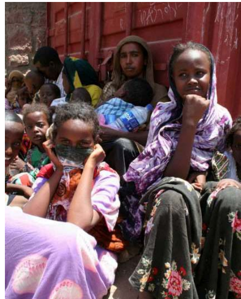
A group of women wait outside the Djibouti Refugee Agency office in Yemen to register as asylum seekers. The wait could take days. Once registered, they are transferred to Ali Adeh where UNHCR provides assistance.

Because Australia receives so few onshore asylum applications, we can easily admit all of those who reach Australia who are found to be in need of protection. Dozens of poorer countries, however, receive a much larger number of refugees and require assistance from other countries to fulfil their protection obligations. Australia provides this assistance through the offshore component of our refugee program. This is a voluntary scheme under which Australia resettles recognised refugees who have been referred by the UN. The offshore component also includes a special visa category for people who might not meet the UN criteria for refugee status but who are nonetheless subject to serious human rights abuses overseas.