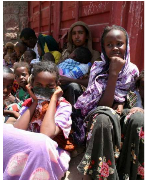
A group of women wait outside the Djibouti Refugee Agency office in Yemen to register as asylum seekers. The wait could take days. Once registered, they are transferred to Ali Adeh where UNHCR provides assistance.

Because Australia receives so few onshore asylum applications, we can easily admit all of those who reach Australia who are found to be in need of protection. Dozens of poorer countries, however, receive a much larger number of refugees and require assistance from other countries to fulfil their protection obligations. Australia provides this assistance through the offshore component of our refugee program. This is a voluntary scheme under which Australia resettles recognised refugees who have been referred by the UN. The offshore component also includes a special visa category for people who might not meet the UN criteria for refugee status but who are nonetheless subject to serious human rights abuses overseas.