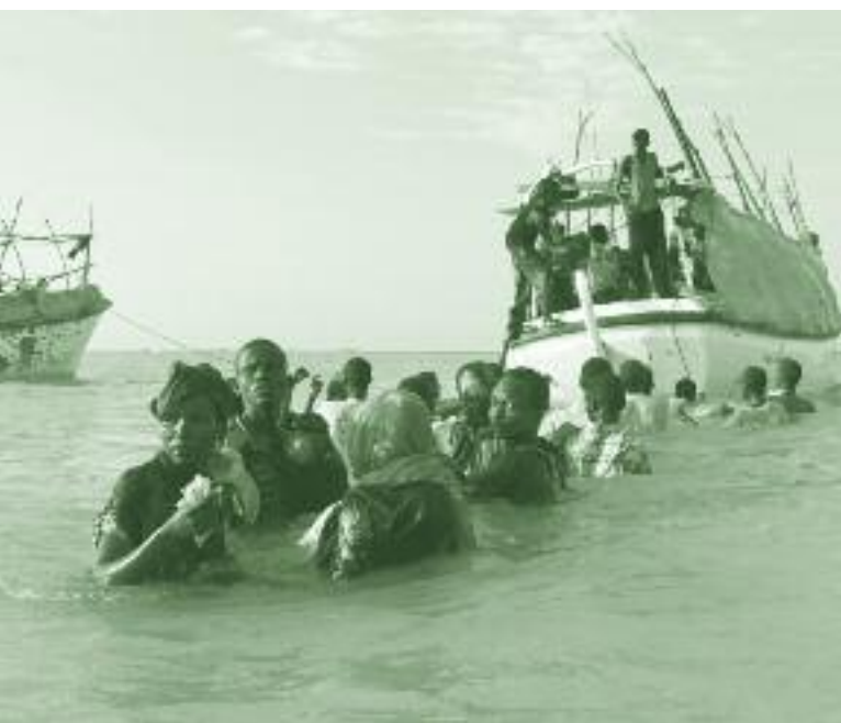
Somali refugees look back anxiously from the sea as they prepare to board a smuggler's boat departing to Yemen. Only eleven of the 128 people who took this boat were ever to reach Yemen alive.

While the 2009-10 year saw some positive improvements to Australia's refugee policy, the process of reform began to falter in some key areas with the resurgence of negative media coverage on refugee and asylum seeker issues and the development of damaging policies towards asylum seekers. RCOA was very active in representing the views of its membership on these developments. We remained in regular contact with our members and others working with refugees and asylum seekers through consultations, regular teleconferences on policy issues, meetings on specific issues, participation in interagency meetings and canvassing of views from specialist agencies. Using this feedback to inform our work, RCOA closely monitored policy developments, engaged in regular dialogue with Government and contributed to numerous government inquiries on refugee issues.