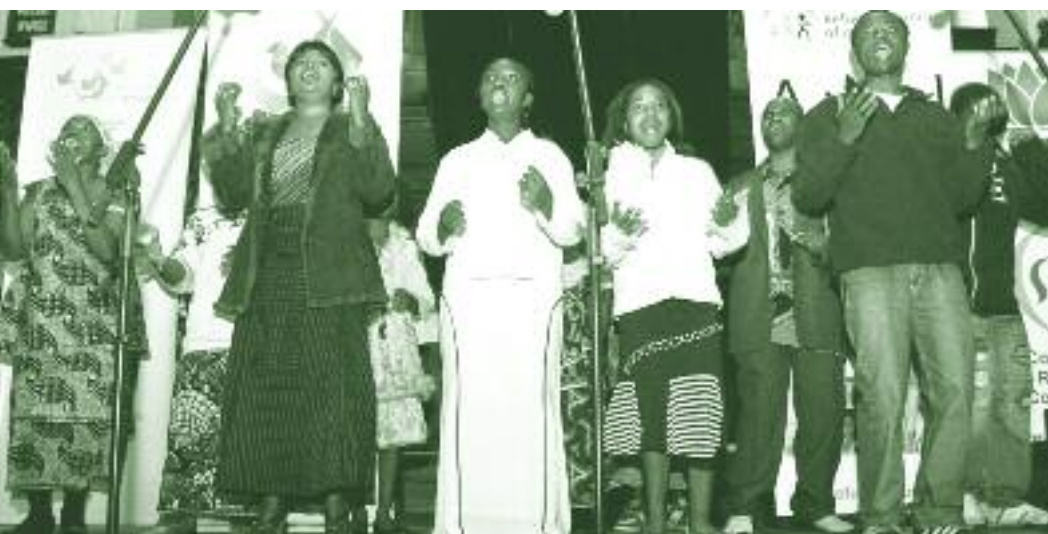
Refugee Week: the Burundian choir performs at the 2010 Sydney launch of Refugee Week.

Our communication channels include our website, a monthly e-bulletin and a quarterly newsletter. After the merger with A Just Australia, we continued with the AJA regular e-bulletin sent to many thousands of readers. The bulletins provide up to date information on refugee policy, research, opportunities to engage with refugee and asylum seeker issues in a range of ways, as well as a summary of the main media for the month. Both the RCOA and the AJA bulletins regularly receive unsolicited praise from members for the quality of the bulletins and the succinct nature of the material included. In addition to the e-bulletins, we provide quarterly newsletters sent via post to our non-email members and supporters.