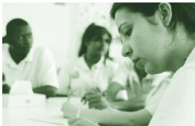
Students at Lurnea High School take part in creative writing activities, run by Bankstown Youth Development Services, as part of the Refugee Action Support program.

In February 2010, RCOA released a literature review on the economic, social and civic contributions of refugees in Australia. Commissioned by DIAC, the work examined relevant national and international sources, identifying key findings and emerging themes as well as information gaps and future areas of research. RCOA found that the 750,000 refugees and humanitarian migrants settled by Australia since Federation have had a profound impact in enhancing the nation's social, cultural and economic life. The research revealed that refugees make substantial contributions to their new country – expanding