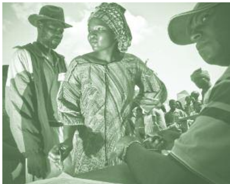
Workers verify registration of refugees in the Oubangui River region of the Republic of Congo before allowing them to collect aid items.

In a submission to the Parliamentary Joint Standing Committee on Migration, RCOA called for the Australian Government to change its approach to handling offshore refugee and humanitarian visa applications for people with disabilities. RCOA argued for the Refugee and Humanitarian Program to be excluded from the government's migration health requirement, given the high numbers of refusals for refugees with disabilities and the vulnerability of those involved. In 2008-09, 116 offshore Refugee and Humanitarian visas were refused on health grounds, while only 69 applicants were granted a health waiver. RCOA also recommended that all applications for family reunion made by refugee and humanitarian entrants under the family stream of the general migration program ought to be eligible for a waiver of the health requirement, with an automatic presumption of a waiver grant. CEO Paul Power presented evidence to a hearing of the Parliamentary committee. RCOA also signed a joint submission to the inquiry led by the Australian Federation of Disability Organisations and