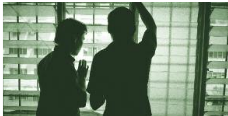
In Malaysia, as in many other Asian countries, even official UNHCR refugee status does not always afford adequate protection. These two Afghan refugee brothers in their 20s are not allowed to work legally, even though they are desperate to support their families.

Another significant step forward was the restoration, after eight years, of some core funding from the Australian Government. The $120,000 grant from the Department of Immigration and Citizenship (DIAC) assisted RCOA to continue its role of providing fearless and independent advice on refugee policy issues, based on a sound understanding of the issues faced by refugees, asylum seekers and the organisations which support them. RCOA maintains a diverse range of funding sources, with more than 60% of funding in 2009-10 received from sources independent of the Australian Government. We were very pleased to receive support again from