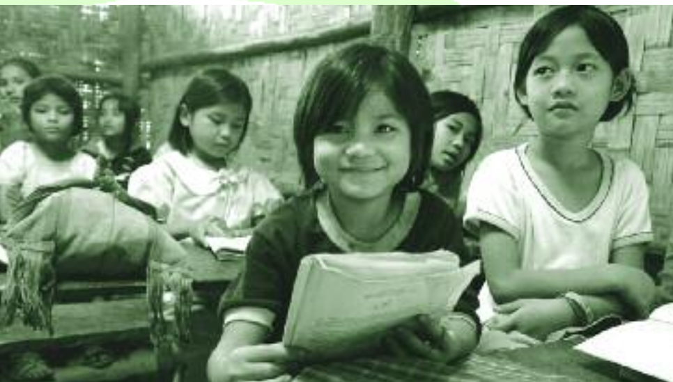
Refugee children from Burma in class at Umpium Refugee Camp in western Thailand.

During 2009-10, RCOA completed or released seven significant research documents relating to Australia's refugee program and settlement issues.